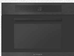
FBIMWO 38L CGS BS