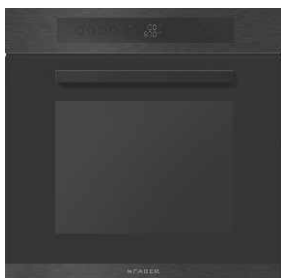
FBIO 80L 10F BS